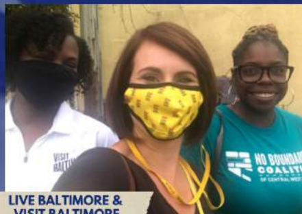
LIVE BALTIMORE & VISIT BALTIMORE