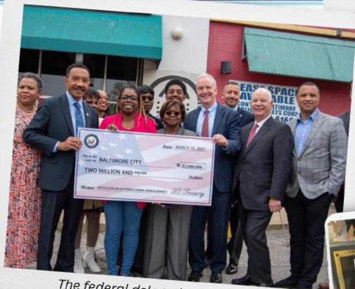
The federal delegation held a press conference to announce a $2 million investment into the Historic Pennsylvania Avenue Market and its upcoming revitalization.