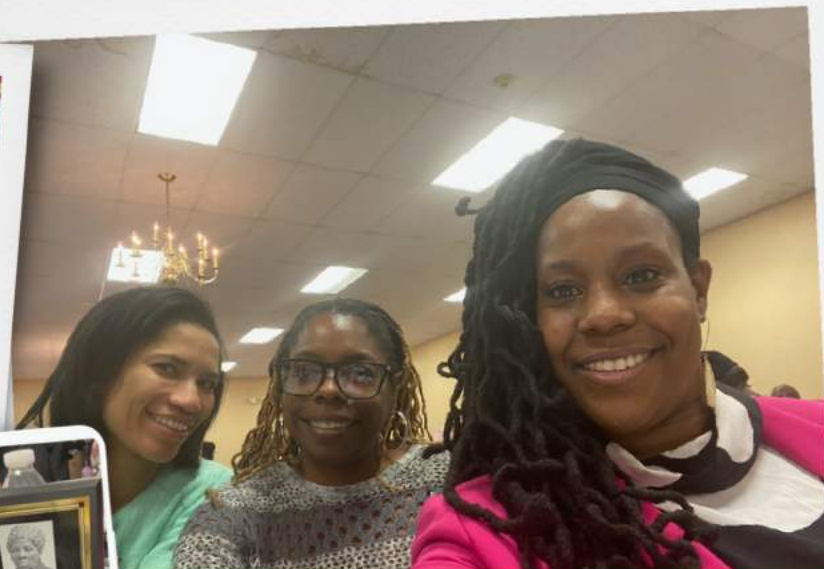
The ladies of No Boundaries Coalition were awarded the Harriet Tubman Freedom Award from Let's Thrive Baltimore, We Our Us and a living descendant of Mother Harriet.